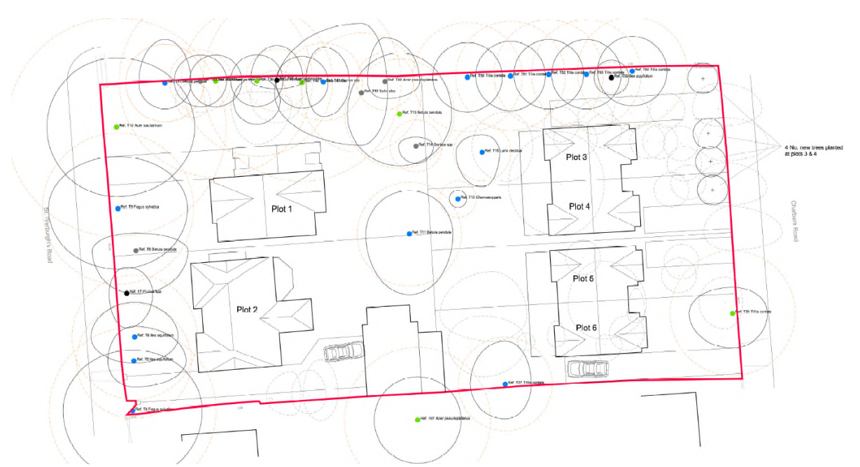
Proposed site layout (St Werburghs Road is to the left and Chatburn Road is to the right)

All of the proposed properties are provided with extensive gardens to the front and rear, which is typical of the area. The overall density of development on the site is 23 dwellings per hectare which, whilst relatively low, does reflect the on site constraints of the trees.