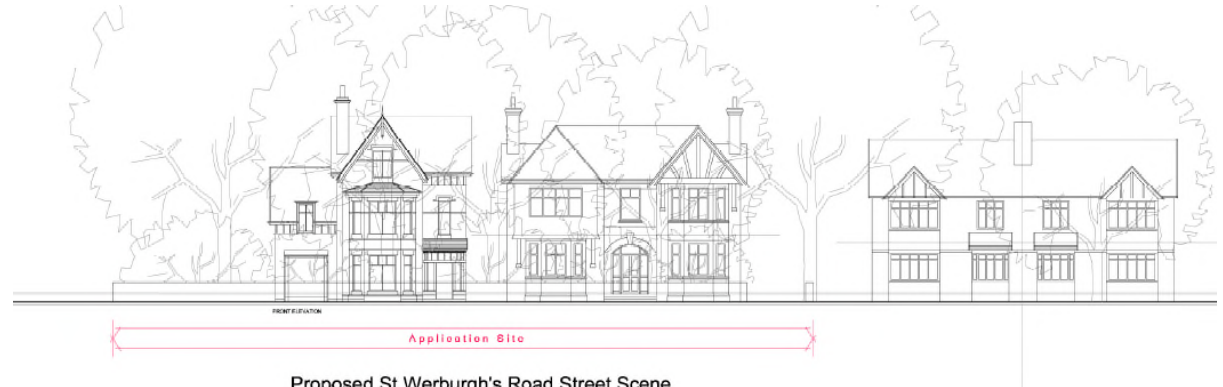
Proposed St Werburgh's Road Street Scene

at ridge height. The design of the dwelling is influenced by the surrounding large villas. The property has an attached garage and a drive from St Werburghs Road. The accommodation would comprise on the ground floor the entrance hall, a reception room, kitchen/family room, dining room/study, utility room and garage. The first floor would comprise a master bedroom with en suite and dressing room, two bedrooms and a family bathroom and the second floor would provide two bedrooms both with en suite facilities.